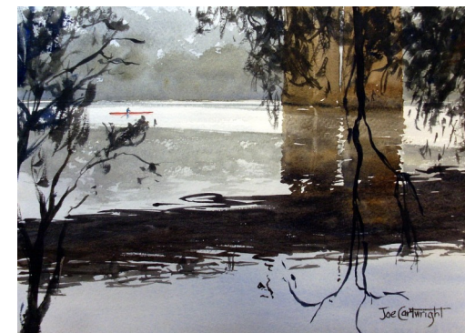
Under Victoria Bridge, Penrith, NSW