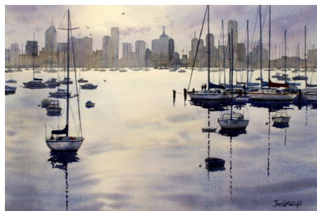
Williamstown Sunrise, Melbourne