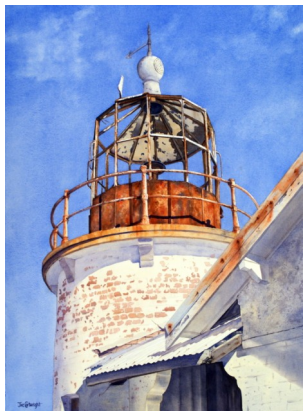
Crookhaven Heads Lighthouse