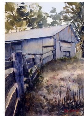
Old Shearing Shed