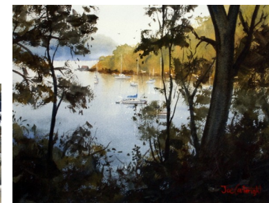
Through the Trees, Brooklyn, NSW