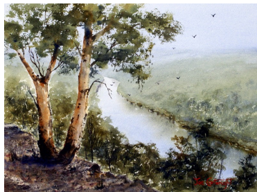
The Rocks Lookout, Nepean River