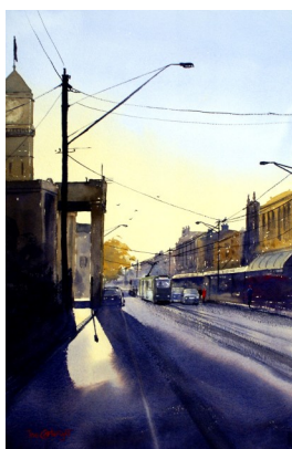
Richmond Town Hall, Melbourne