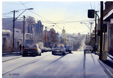
Early Morning, Bridge Street, Melbourne

He encourages students to ask questions about any aspect of watercolour and their work.