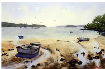
Salamander Bay, Port Stephens, NSW